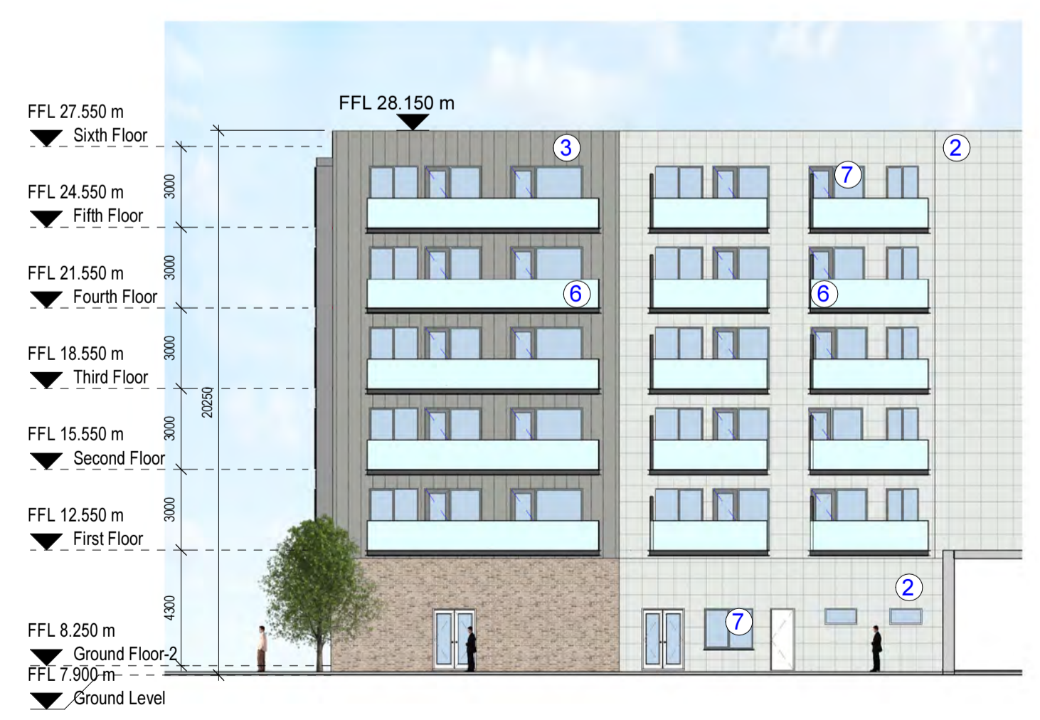
BLOCK B - WEST ELEVATION 2 Scale 1 : 200