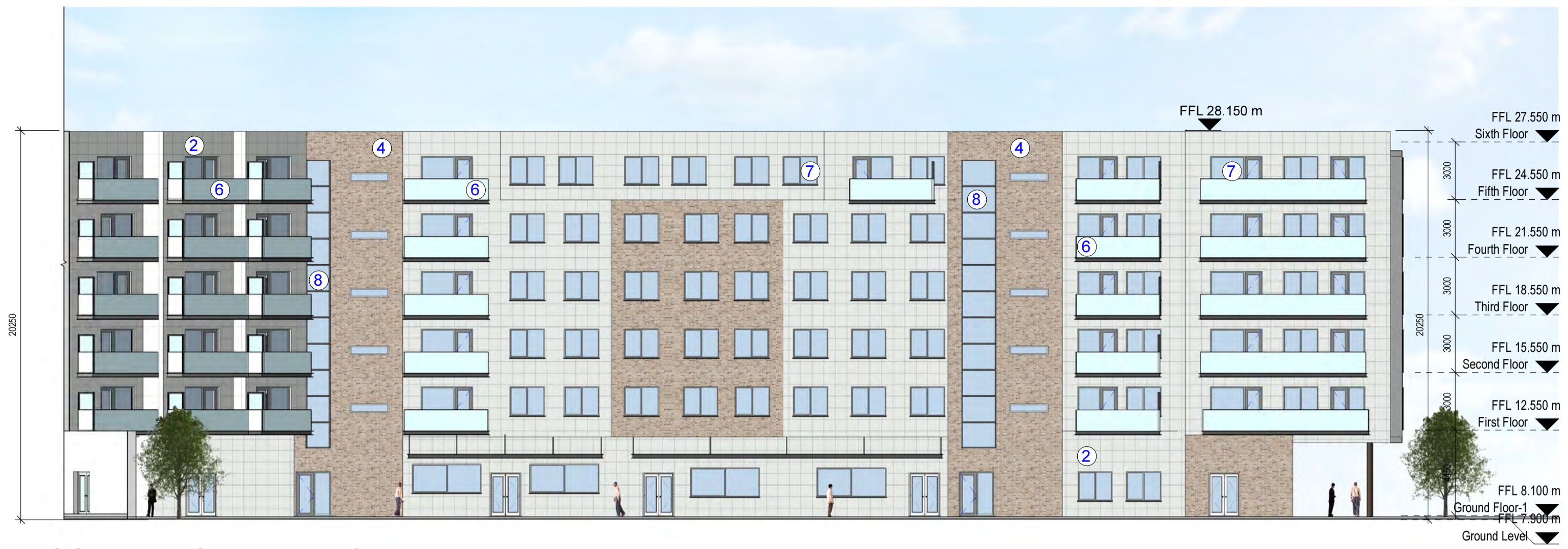
BLOCK B - EAST ELEVATION 2 Scale 1 : 200

GENERAL NOTES - ** Do not scale from this drawing *** Use figured dimensions only © This drawing is copyright. No part of this document may be reproduced or transmitted in any form or stored in any retrieval system from the copyright holder, except as agreed for use on a project, for which the document was originally issued.