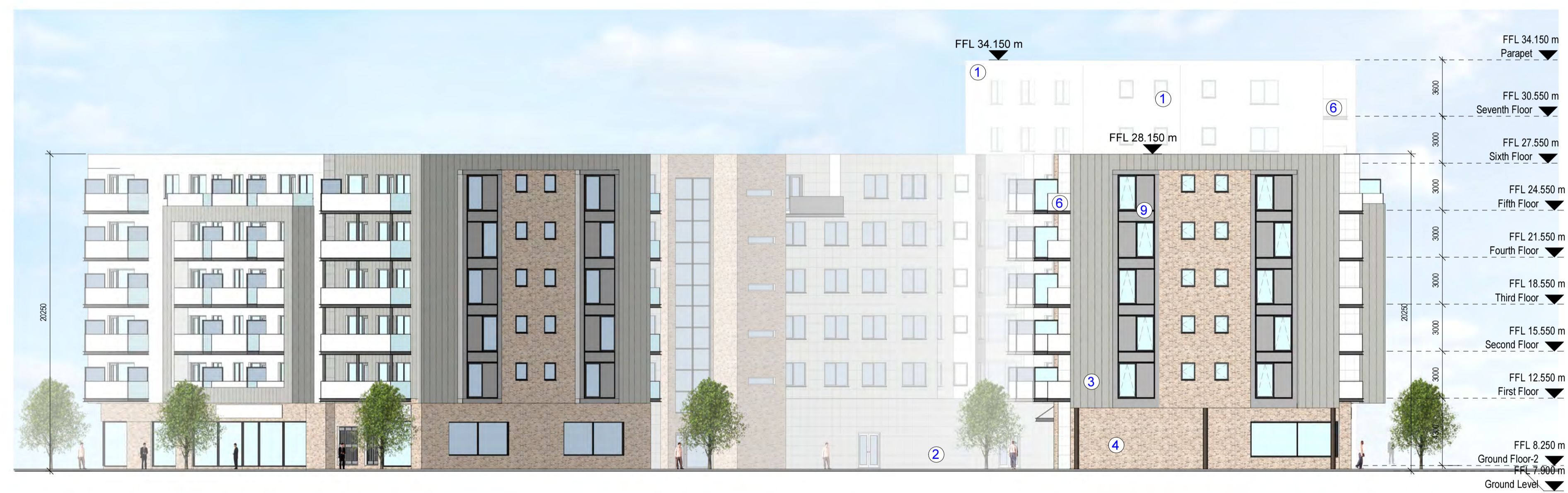
BLOCK B - NORTH ELEVATION Scale 1 : 200

NOTE: ALL MATERIALS TO BE AGREED BY WAY OF COMPLIANCE WITH COUNCIL